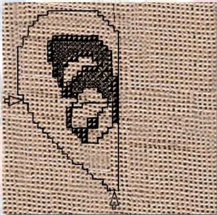
Diagram 1 gives half of the design, centre indicated by arrows which should coincide with the basing stitches.